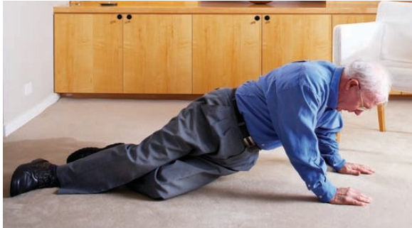
2. Crawl or drag yourself to a chair