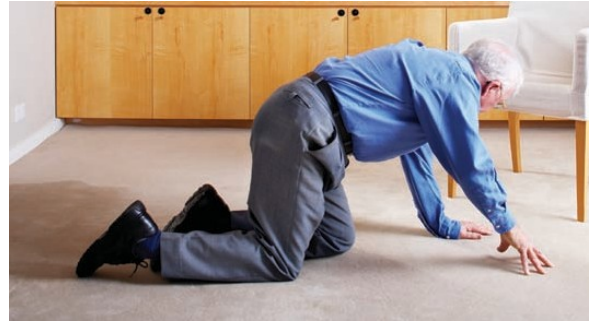
3. Face the chair and get up on your knees