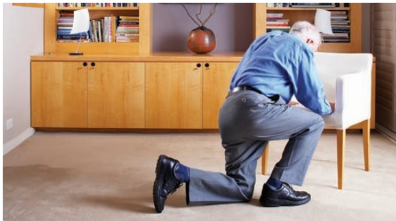
4. Bring one knee forward and put that foot on the floor; then use the chair to push up with your arms until you are upright enough to pivot your bottom around to sit